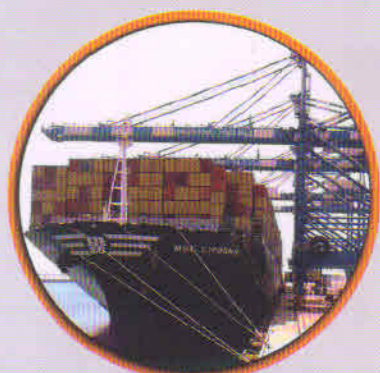
MARINE & PORTS